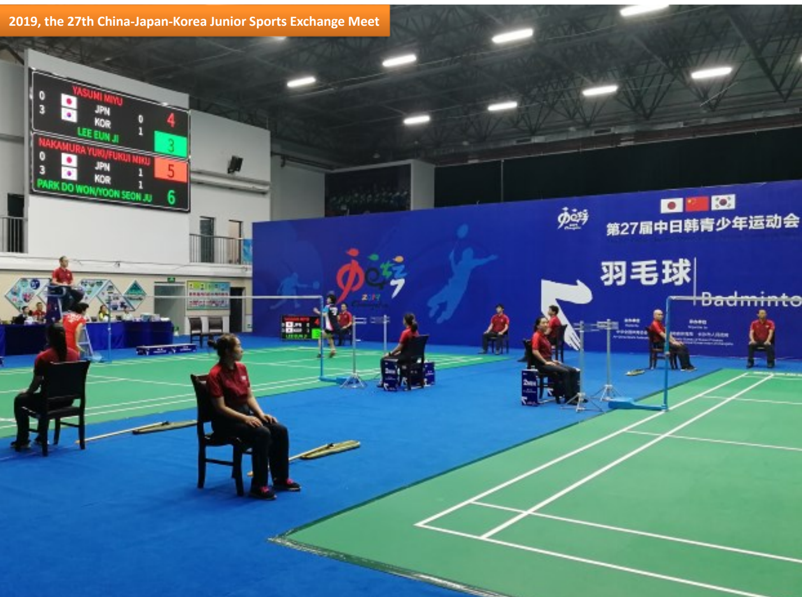
2019, the 27th China-Japan-Korea Junior Sports Exchange Meet

It is an ideal choice for most of smart and professional stadiums.